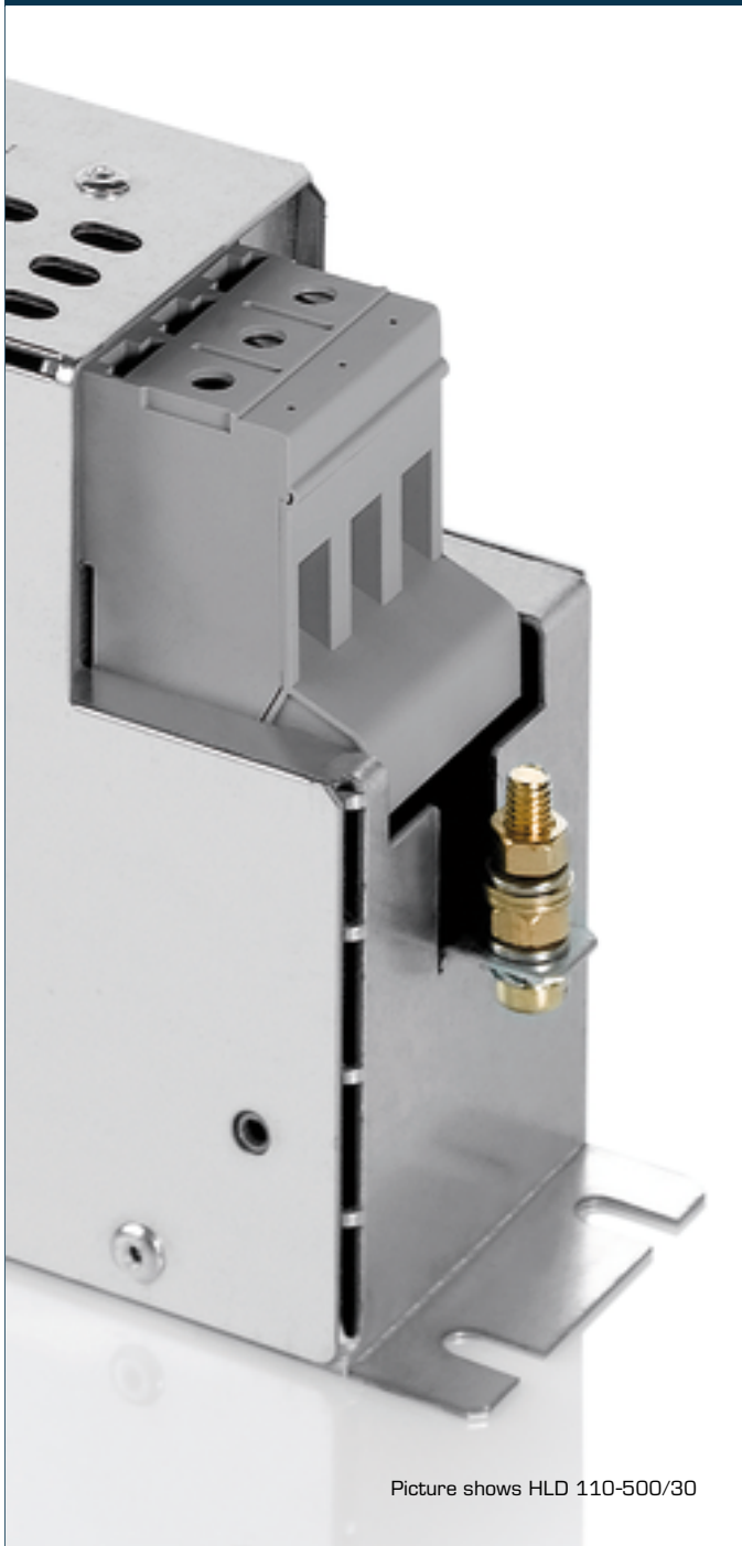
Picture shows HLD 110-500/30